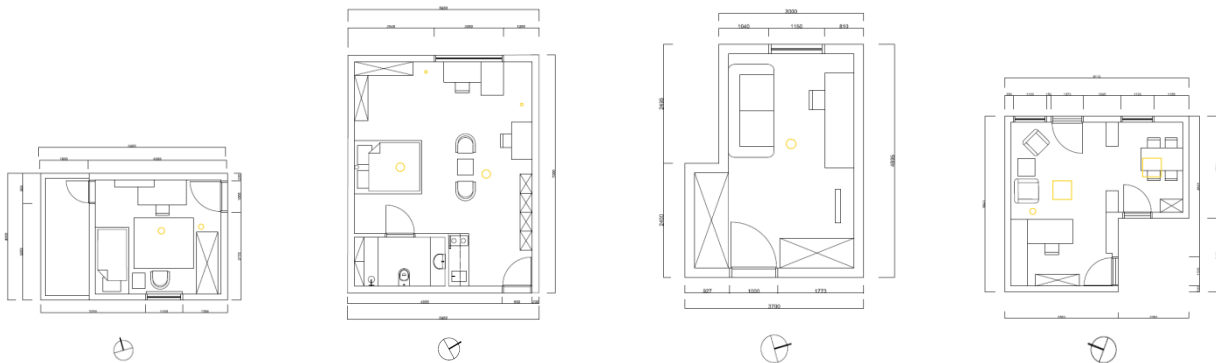
Figure 1: Some of the small scale floor plans (not scaled, orientation arrows pointing in north direction)

Case study home offices: All together 9 different home offices that encompass 10 work places (1 in each residential unit, except one encompassing two work spaces) were examined (named A-J). The involved professions that can be found in the offices can be considered as diverse and include lawyers, journalism free-lance IT professionals as well as architects and industrial designers. Figure 1 illustrates some floor plans of the examined offices. In each of the spaces the task area of the specific work place was identified, and in further evaluation steps clearly distinct from other areas of the corresponding space (living, sleeping, kitchen, etc.).